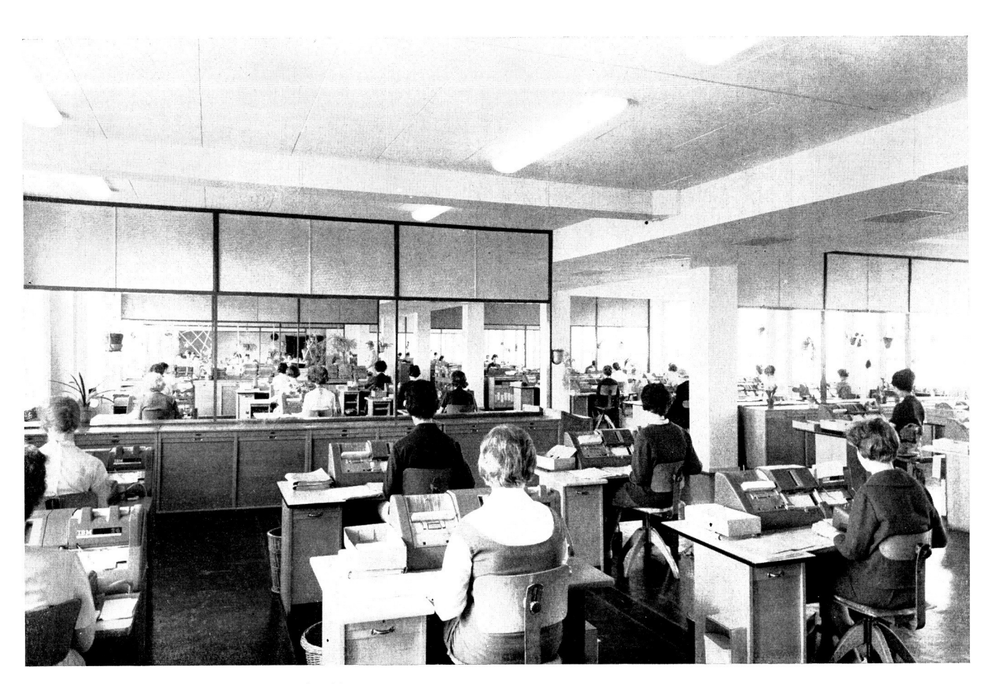
Punching room of the Federal Statistical Office

The considerable share in the total cost of machine tabulation taken up by punching and verifying of punch cards as well as the expenditure of time involved in the punching procedure, induced some firms to develop magnetic character readers permitting original vouchers to be processed in a fully mechanised process. By means of special printing types and prepared ribbons, magnetic characters are inscribed in the particular box of the forms. The whole printing field can be covered by the reading device and transferred to a computer for further processing.