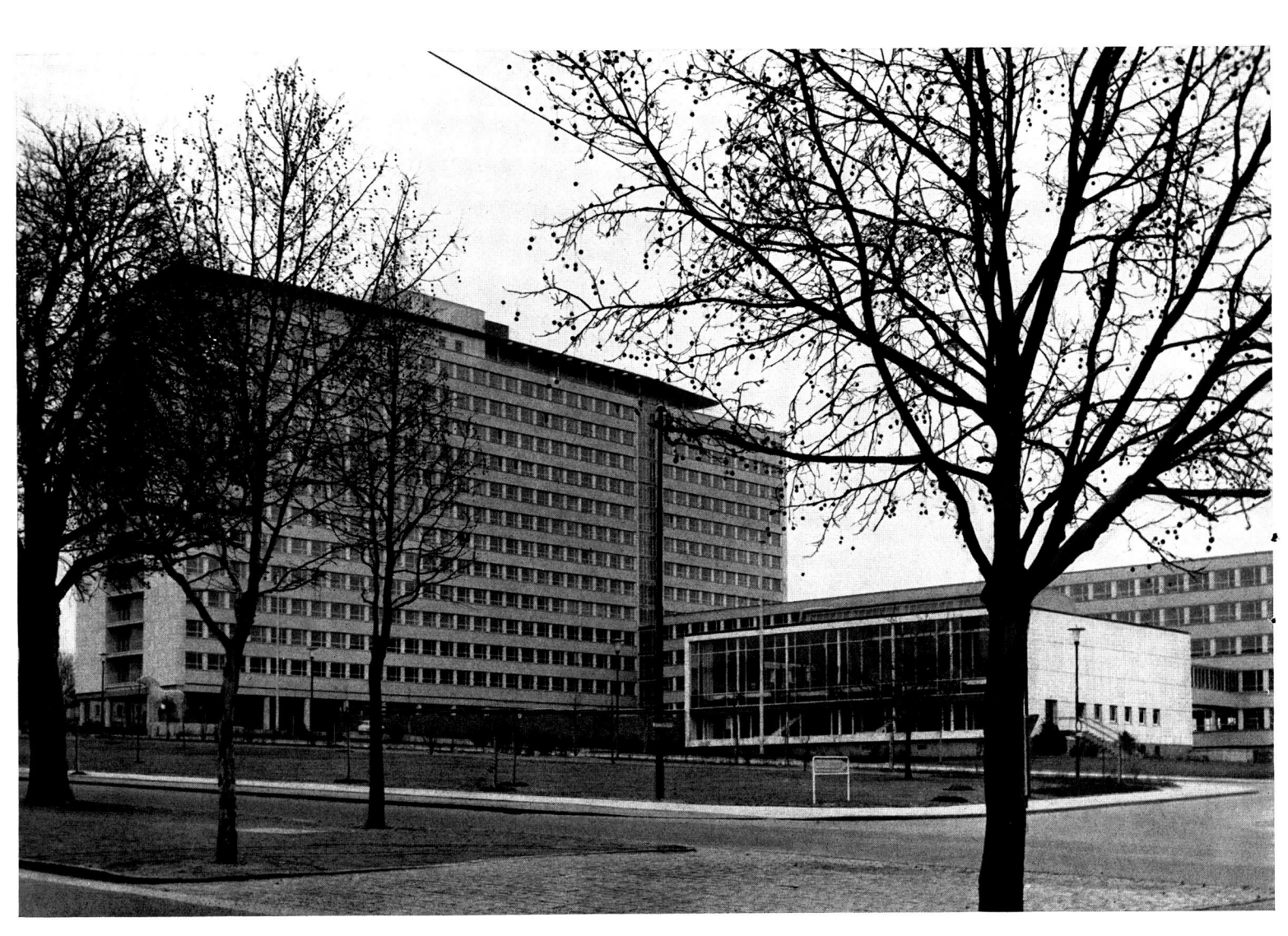
Federal Statistical Office