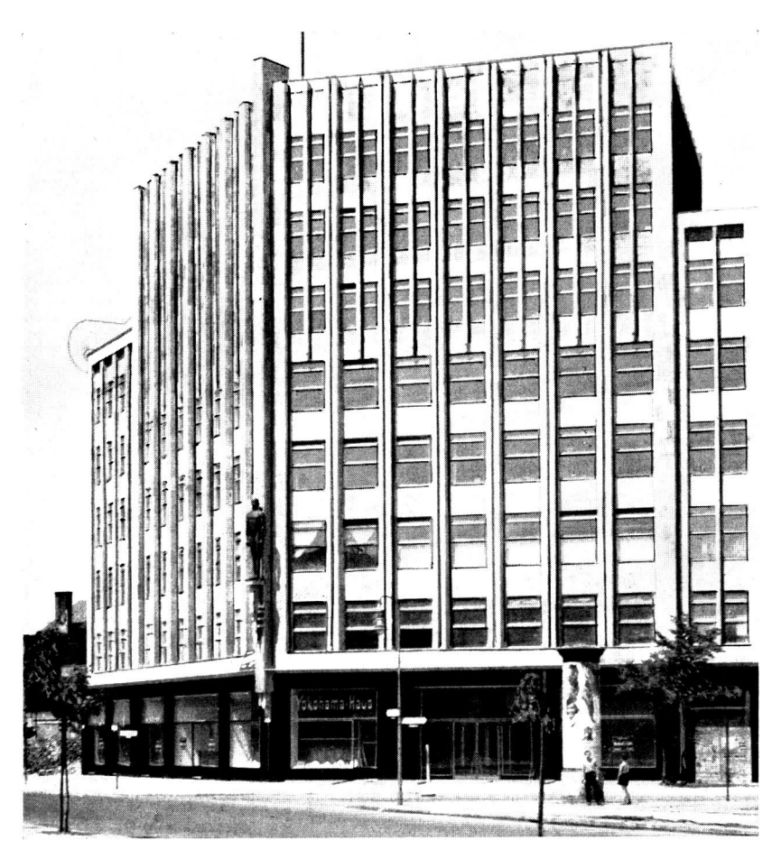
Branch Office Berlin of the Federal Statistical Office

is closely related to the task of coordinating the results of the individual statistics in such a way that they fit into an overall statistical picture of economy. The general frame is provided by national accounts the elaboration of which has been expressly assigned to the Federal Statistical Office by legislation.