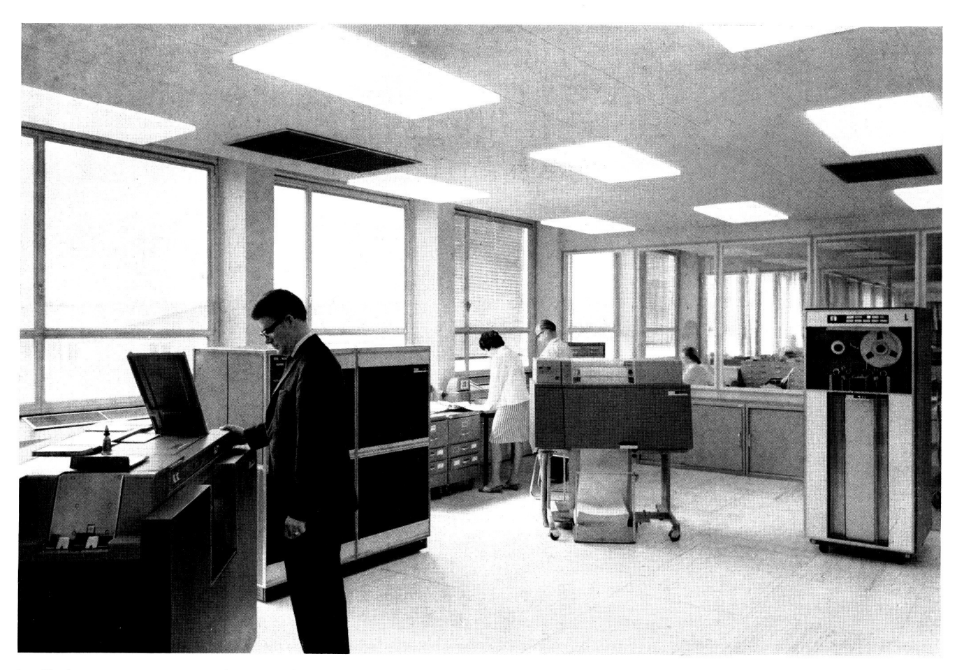
Small electronic computer at the Federal Statistical Office

Simultaneously, the vouchers can be sorted towards one particular spot of the printing field.