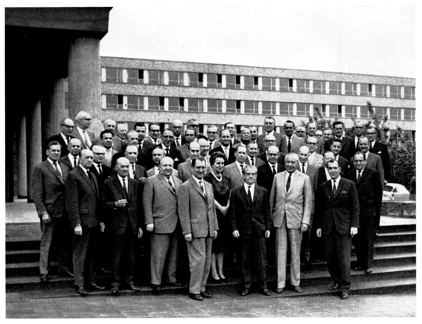
Participants of the 9th Meeting of the Advisory Committee held in Wiesbaden on 8 and 9 May 1962

Federal Statistical Office in the chair — to deal summarily with the whole statistical work programme and individual questions of topical interest and special importance.