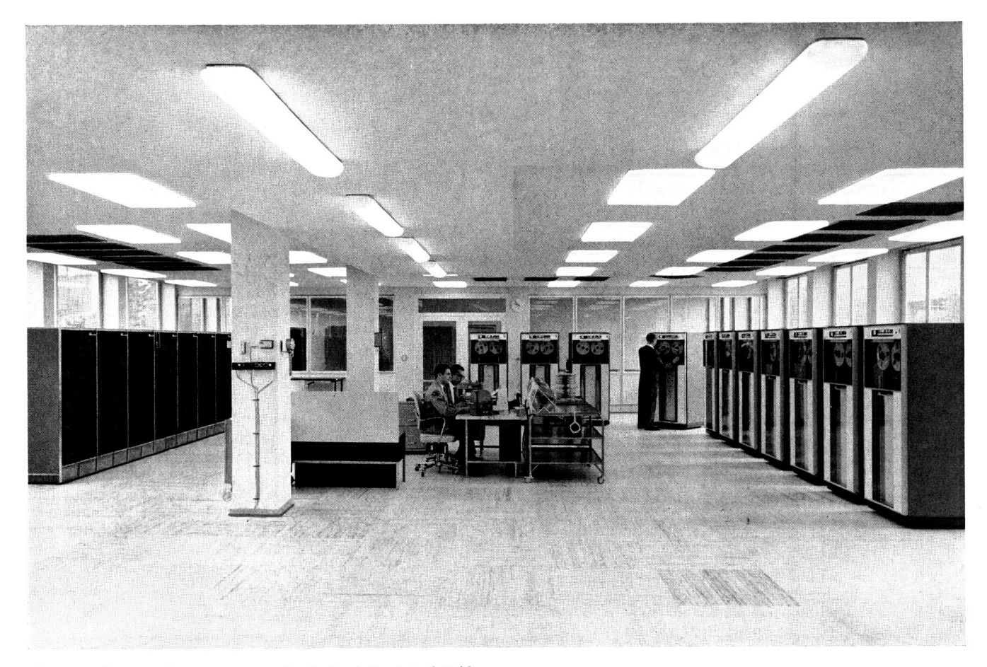
Electronic large-scale computer at the Federal Statistical Office

A switch-over to small electronic computers is also being envisaged for the work of the Land statistical offices. From the end of 1961 to autumn 1962, such installations were installed at the Land statistical offices. They are to be used, for the time being, for processing the 1960/62 censuses. When these tasks will be completed in the second half of 1963, it is intended to shift the regular work from the conventional tabulating machines to these electronic computers. Thus it is possible to reach a uniformity in the machine equipment which permits the programming work for corresponding jobs of all Land statistical offices to be performed at only one place. Copies of the programming documents, as well as duplicates of the programming cards, can then be circulated to all the other Land statistical offices. Deviations from this programme in individual Laender can in part be considered by changes to the standard computer programme.